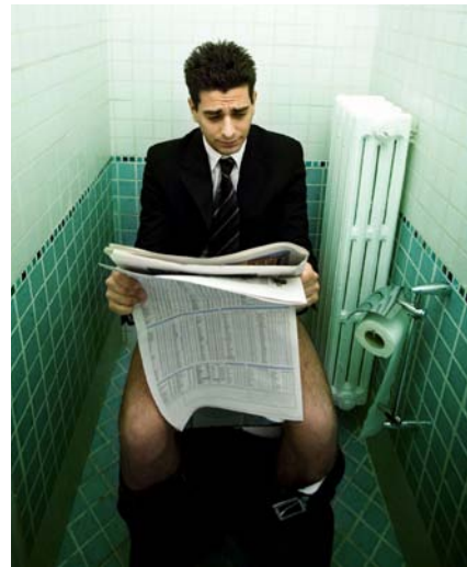
Prolonged sitting on the toilet seat can cause haemorrhoids

Many methods have been developed to treat bleeding piles, but the current gold standard is stapler haemorrhoidectomy, a quick and virtually painless procedure. However, it does have its fair share of setbacks.