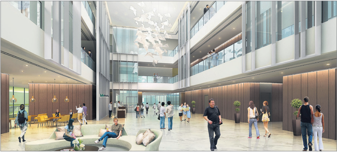
The new extension lobby features a generous triple volume space, giving visitors and patients a grand sense of arrival.