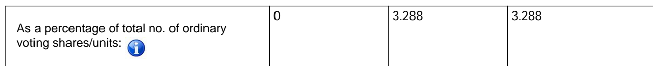
Table 3. Change in respect of rights/options/warrants over shares/units of Listed Issuer